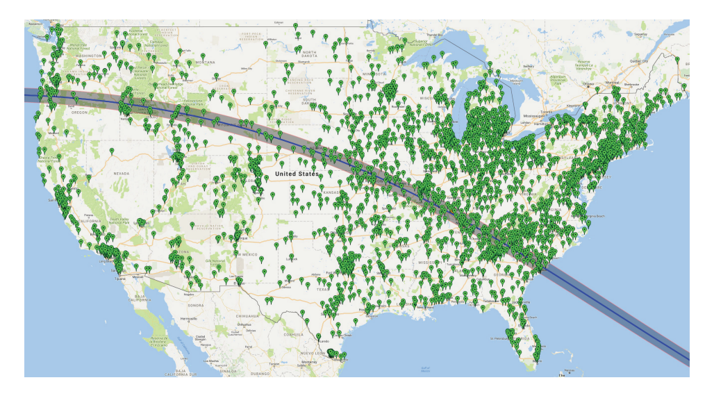
Figure 1. Map showing the participating library systems in the U.S. together with the total eclipse track. You can see that the libraries involved were much more geographically distributed than the eclipse itself.