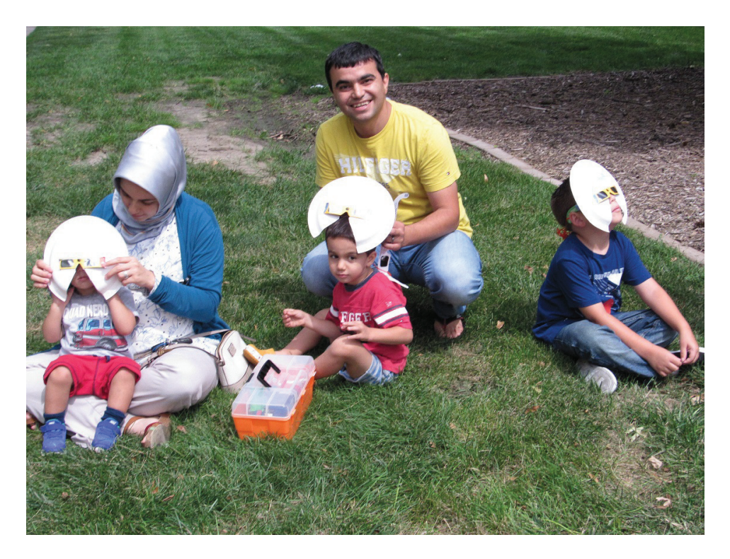
Figure 3. Keene Memorial Library, Fremont, Nebraska

A survey of Eclipse Kit recipients, performed using Survey Monkey, drew 1,193 responses, giving us statistically significant data. About 85% of the librarians indicated that they got all their eclipse glasses through our project. Others were able to get donations or internal funding to acquire an additional supply. More than 65% of the libraries indicated that they had made special efforts to get glasses and information to audiences normally underserved by and underrepresented in science.