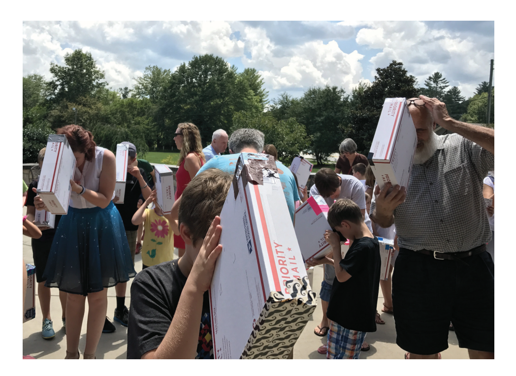
Figure 2. Transylvania County Library, Brevard, North Carolina

"[I did] a training exercise with the librarians at the Manhattan Library in Kansas. I went over several ideas of how we can present to their public about the eclipse...I gave them handouts and posters for their display...I brought many props [and activities] about moon phases, eclipses, the Sun, and [even] the Pocket Solar System activity...They loved everything I showed them...We even discussed extending our partnership for future outreach programs with their public."—Amateur Astronomer (Member of one of the Night Sky Network Clubs)